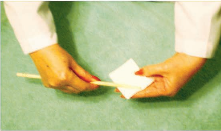
Figure 2. How to make special cotton applicator for Deep Milk Peel