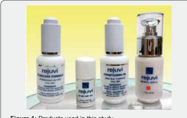
Figure 1: Products used in this study.

Scar Care Formula from Rejuvi Laboratory Inc. was used as professional treatment in salon or clinic. Scar Aftercare Kit consisting of Conditioning Oil, Retinyl Serum and Scarcare Gel from Rejuvi Laboratory Inc. was used as home care after professional