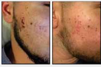
Figure 4: Keloid Scar days after 1 treatment.